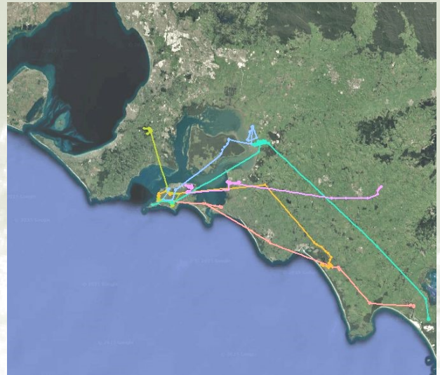
Figure 1. GPS tracking of 6 Cape Barren Geese from starting location of Phillip Island (Millowl) to offshore locations. C05 (red) travelled to Yanakie. C22 (orange) travelled to Tarwin Lower. C23 (yellow) travelled to Tyabb. D01 (blue) travelled to French Island and Jam Jerrup. L01 (green) travelled to Yanakie. R10 (pink) travelled to Moe.

Task 12 continued. In addition, many geese have shown a preference for specific paddocks, often returning to the same locations on multiple occasions. Flocks on Summerland Peninsula and Fishers Wetland have dispersed and moved to paddocks off the island highlighting the significant dispersal during the non-breeding season, and suggesting that geese from Phillip Island (Millowl) are connecting with other regional populations.