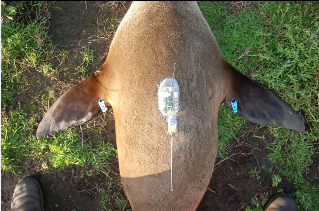
Deployment of the tracker on Jay at Lady Julia Percy Is