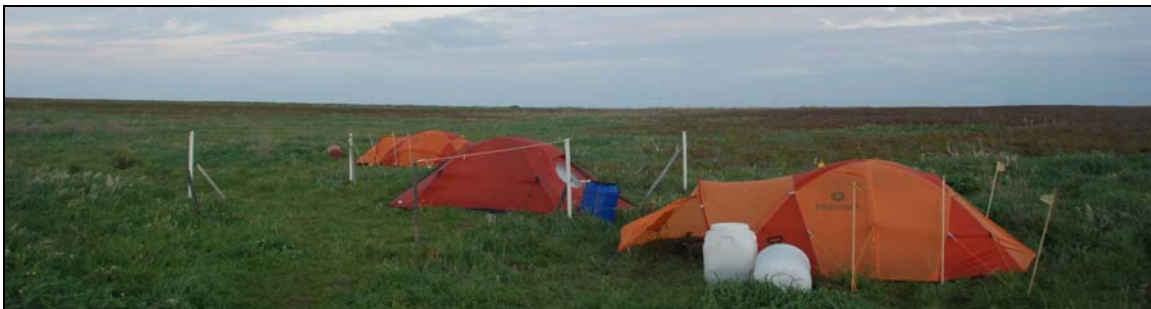
Camping at LJP