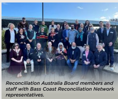
Reconciliation Australia Board members and staff with Bass Coast Reconciliation Network representatives.

They were impressed with what we are achieving here on Bunurong Country and have since invited the Bass Coast Reconciliation Network to attend the annual Reconciliation Australia conference in Brisbane in November to be part of an expert panel to talk about place-based reconciliation.