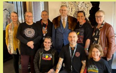
The Bass Coast Reconciliation Network events team

If you missed the exhibition, you can still check out the artworks at NAIDOC Week First Nations Art Exhibition 2024 ( naidoc-art.com.au ).