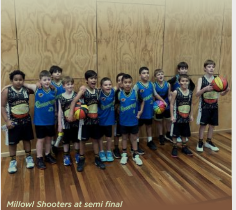
Millowl Shooters at semi final

The Nature Parks were proud sponsors of the Millowl Shooters, an Under 10s basketball team that competed in the Victorian NAIDOC Junior Basketball Tournament in Cranbourne in July this year. Playing deadily, the team made it to the semi-finals, a great achievement for their first tournament.